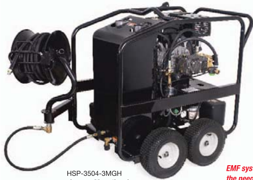
HSP-3504-3MGH shown with optional hose reel