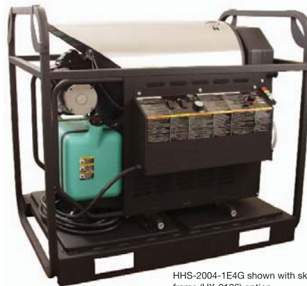
HHS-2004-1E4G shown with skid frame (HX-0196) option