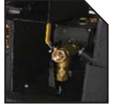
Optional 3-way ball valve