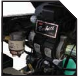
12 Volt Burner with fuel/water separator