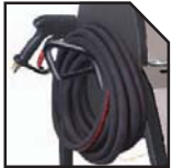
Convenient hose hanger and wand holder