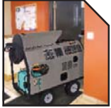
Compact design, fits through a 30-inch doorway