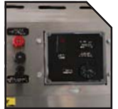
Stainless steel control panel shown with optional steam, high pressure chemical and thermostat