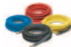
Heavy-duty high-pressure hoses in lengths up to 150-ft.

360° Pivot and non-pivot hose reels keep hose neatly stored and shop areas safe