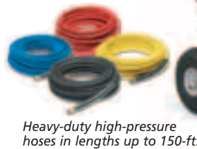
Heavy-duty high-pressure hoses in lengths up to 150-ft.

Telescoping wands extend to 24' to reach high places without scaffolding