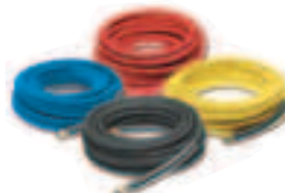
High-pressure hoses from 30 to 150-ft. lengths