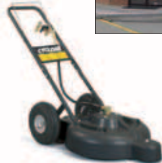
Rotary surface cleaner attaches to your pressure washer; reduces overspray and zebra striping