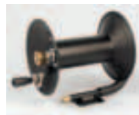
100' E-Zee Hose Reel Kit