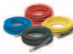
Heavy-duty high-pressure hoses in lengths up to 150-ft.

Hose reels help protect your high-pressure hose