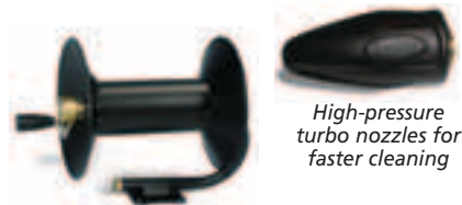
High-pressure turbo nozzles for faster cleaning

Telescoping wands extend to 24' to reach high places without scaffolding