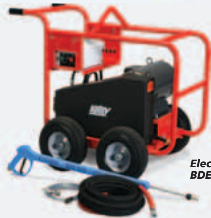
Electric Model BDE-505009B

50 ft. wire-braided hose includes guards, couplers and swivels at both ends