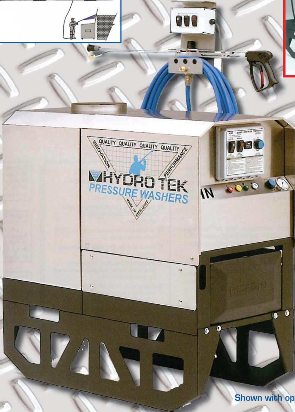
Shown with optional burner cover