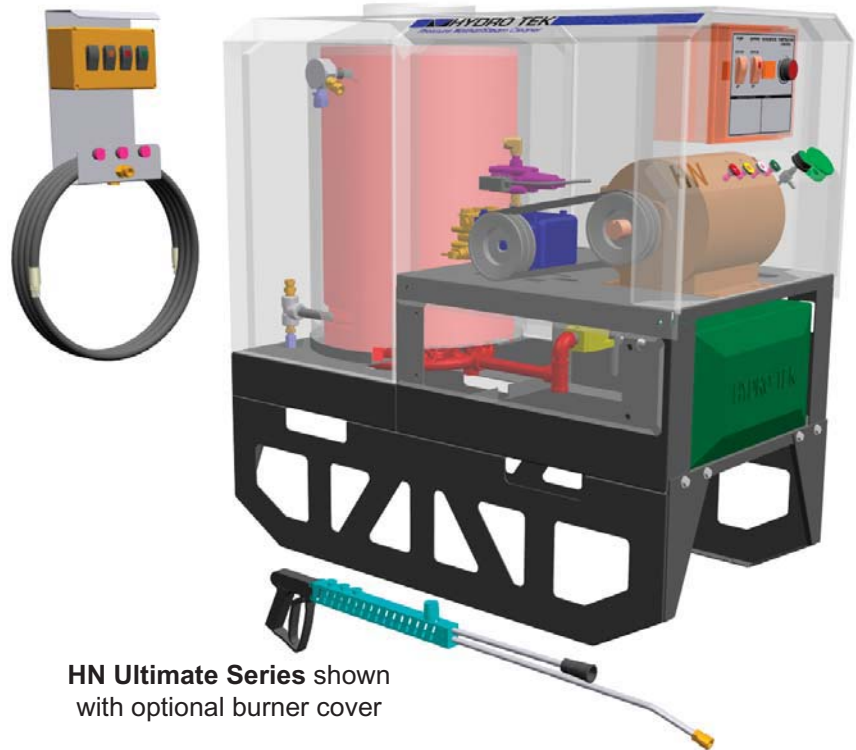
HN Ultimate Series shown with optional burner cover

Pump cooling system prevents pump from overheating in bypass for worry free operation. (Remote wash station and pressure gage not included on HN Proline®)