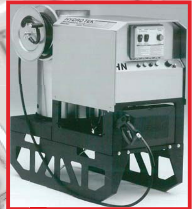
HN Pro Line Series shown w/hose reel option